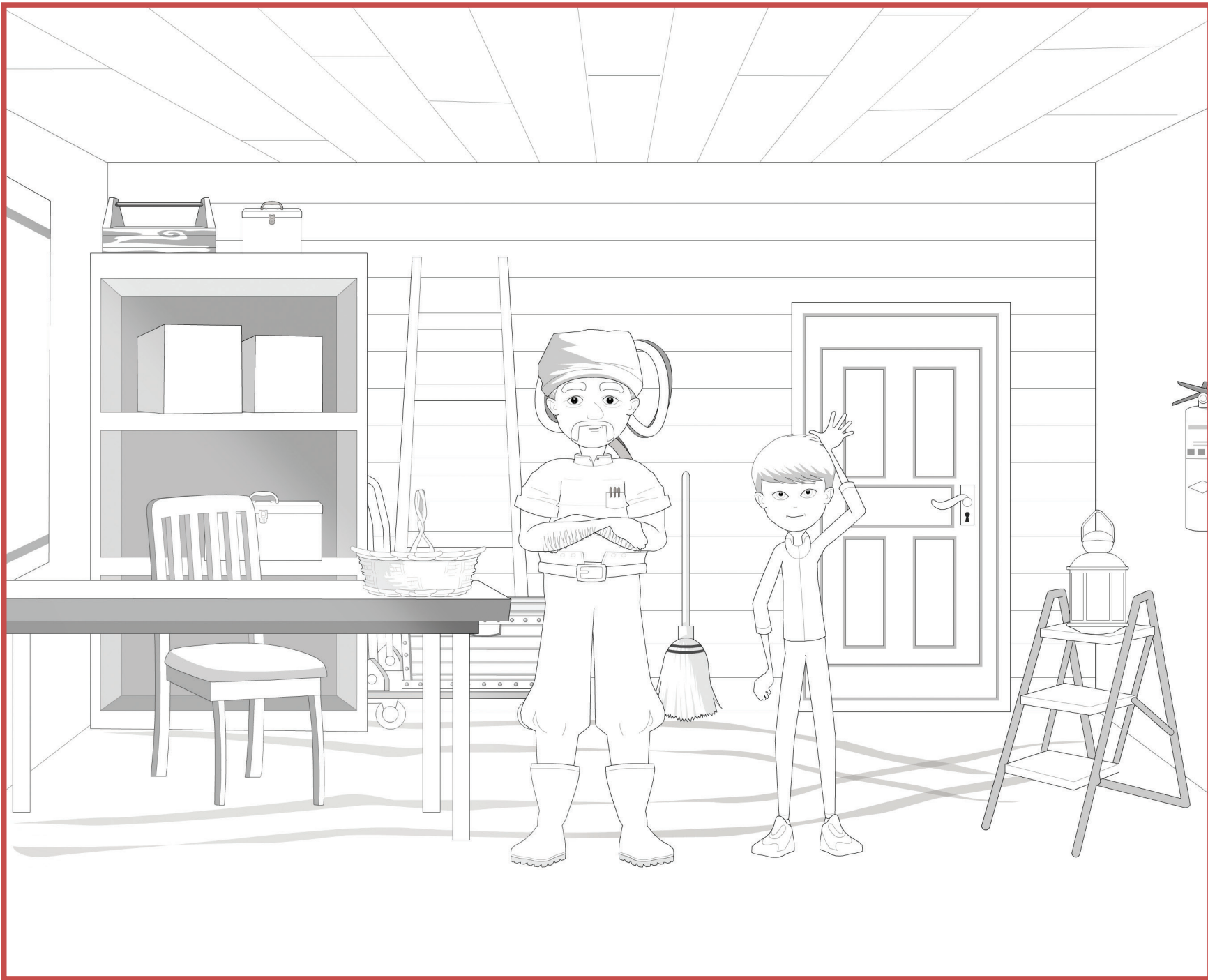
Planche à colorier